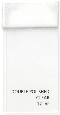
12 mil 972440

The Visilite™ product line from Trivantage® is designed to service all clear vinyl requirements. An industry leader, Visilite FR passed NFPA 701 Test Method 2. Visilite is offered in a wide variety of thicknesses and put-ups to best service your needs. See reverse for complete product offering.