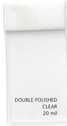
20 mil 972444