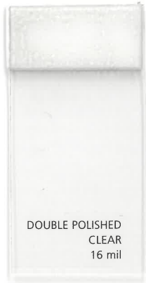
16 mil 972442