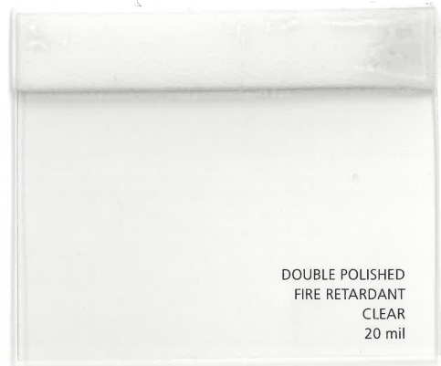
FIRE RETARDANT 972462