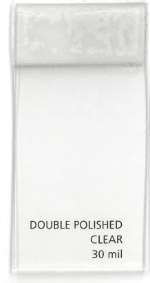
30 mil 972446