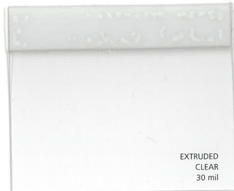
30 mil 972476